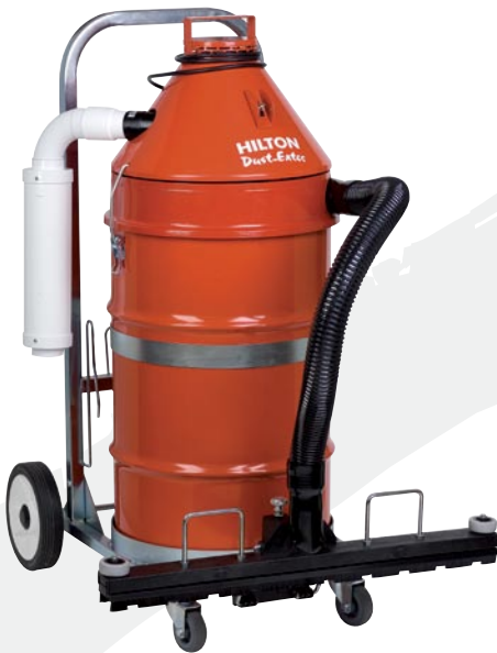
DUST EATER SWEEPER UNIT (Dry only)