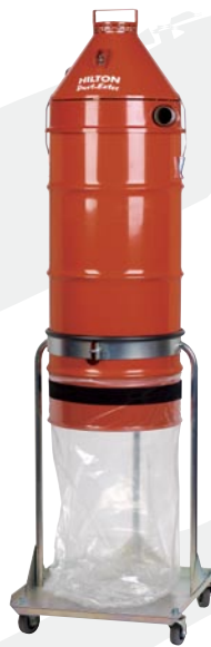
DUST EATER DUMPER