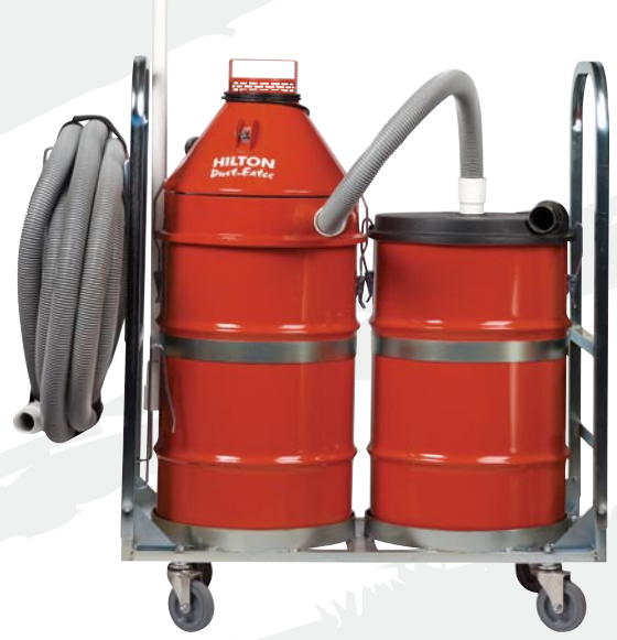
DUST EATER DOUBLE (Dry and Wet)