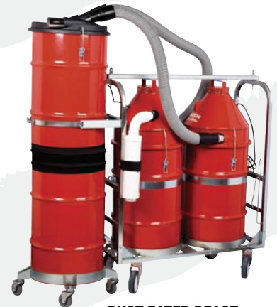
DUST EATER BEAST CS AUTO DUMP PACKAGE

1 Requires 2 Dust Eater Units. Dumper in Bag or Skip configuration, * possible with Skip option only.