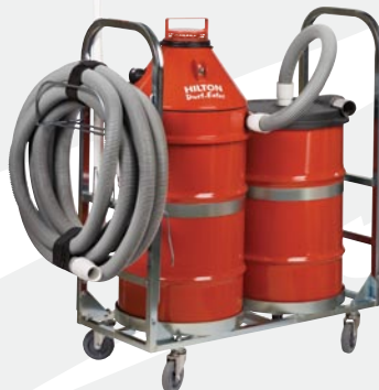
DUST EATER CS DOUBLE UNIT