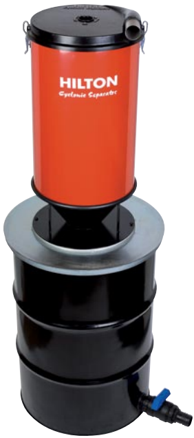
CS FULL EXTENSION 200/210ltr Option pictured