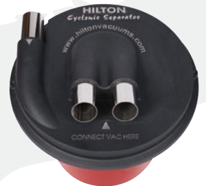
CS HEAD CONFIGURATIONS