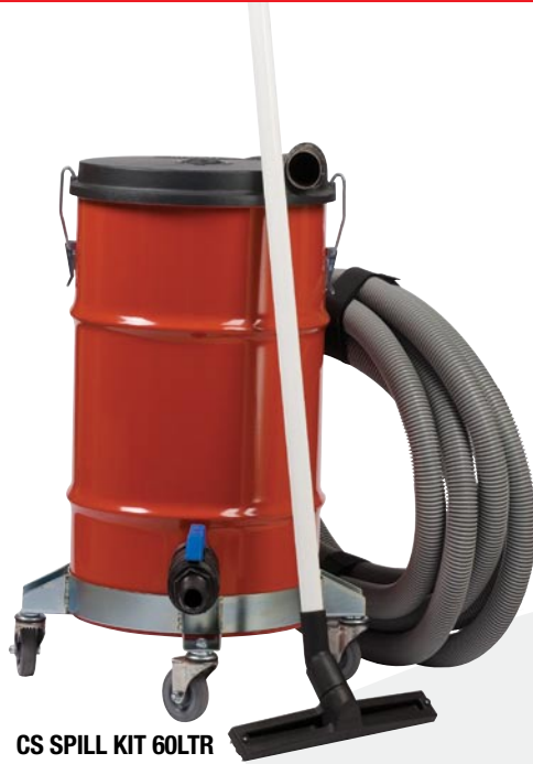
CS SPILL KIT 60LTR