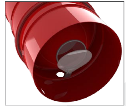
BAG DUMPER SYSTEM