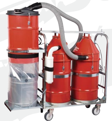
DUST EATER BEAST CS PACKAGE